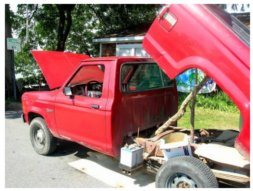
Pete Seeger's modified electric truck on display at the Alternate Energy Festival